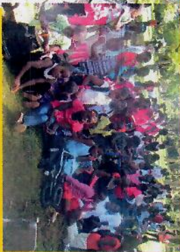
In the orphans and abandoned