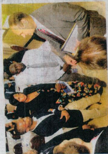
Investors interact with their American counterparts during a meeting in Kampala last week. The meeting was held to foster joint ventures between the business communities from both countries.